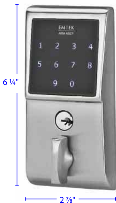
Exterior Projection: 1 1/2"