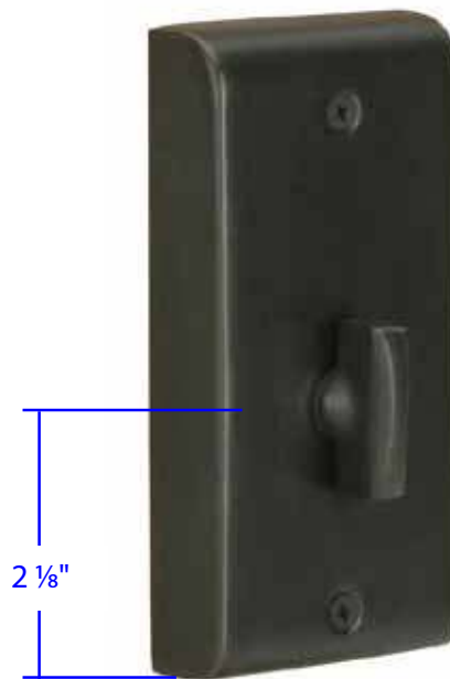
Interior Projection: 1 3/4"