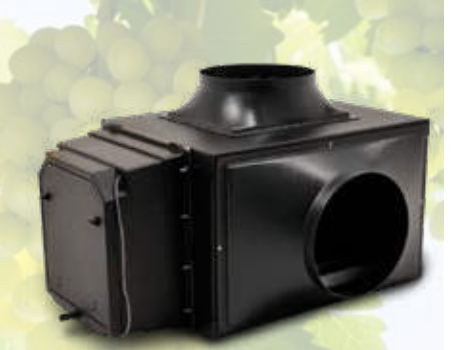
Ducted split system with integrated humidifier