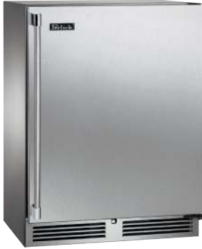
Solid Door Model

Perlick ® QUALITY & INNOVATION THAT INSPIRES