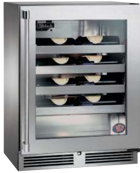
Glass Door Model